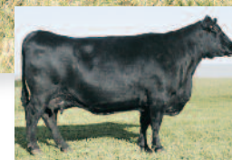
G A R PRIME TIME 2409 Maternal grandam of Lot 17