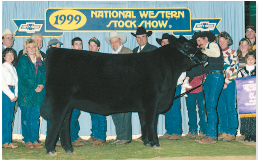
GREENS PRINCESS 7418 Maternal grandam of Lots 24A–23B embryos; also great-grandam of Lots 23–23A–23B

The grandam of these matings, the foundation Princess 7418, reigned as the Grand Champion Female of the 1999 National Western, 1999 Western National, 1998 American Royal ROV, 1998 Western Idaho ROV and junior shows and the 1998 Northwest Regional Junior Preview before becoming the star donor in the Green Angus Ranch herd. Blending this proven heritage with two of the breed's most popular sires—Final Product and O'Reilly Factor—offers endless potential to contribute look and function to any operation.