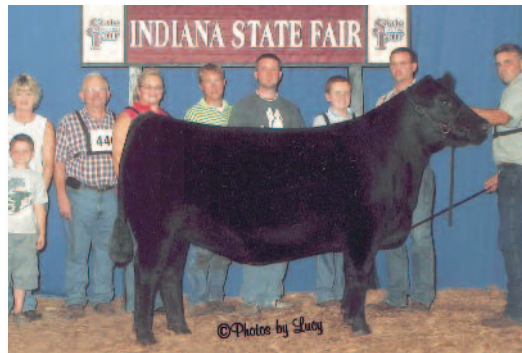
SK PATTON POLLY 814 Maternal sister to Lot 4