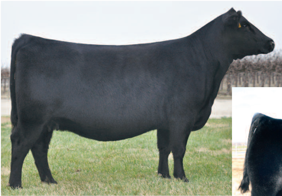
SILVEIRAS ELBA 6551 Dam of Lot 6 pregnancy