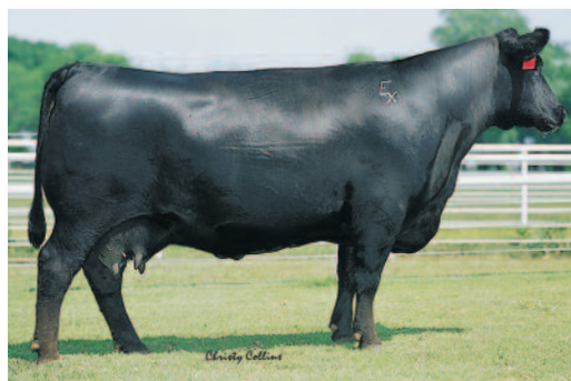
VAR FOREVER LADY 4304 Maternal grandam of the Lot 20 buyer's choice ET heifer calves