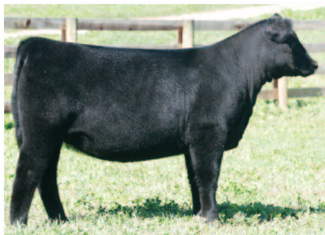
BCII LUCY 6213 $40,000 half interest maternal sister to Lots 12A and 12B pregnancies