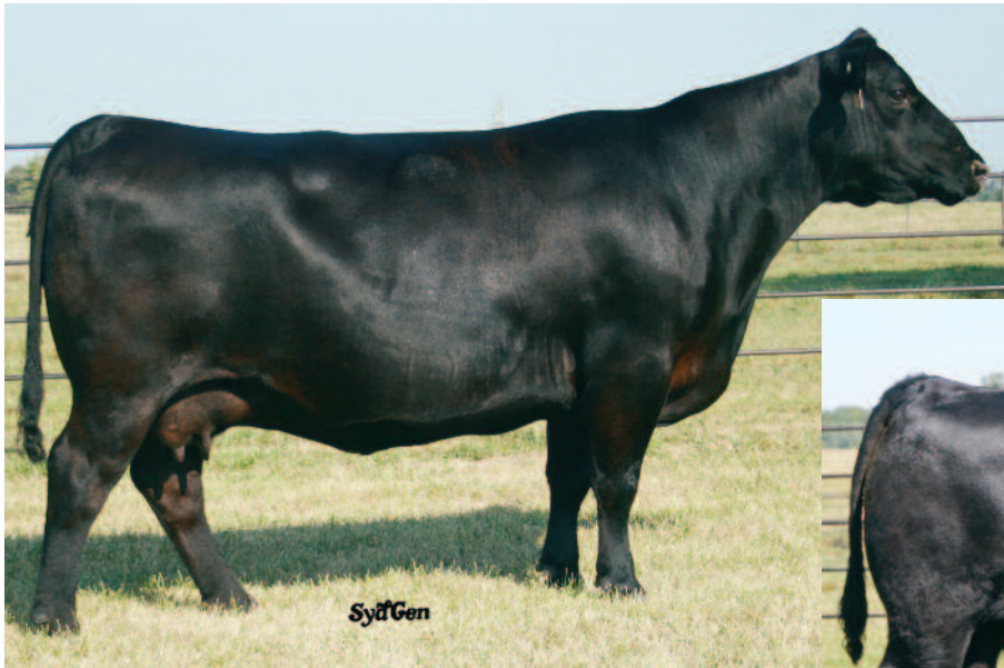
SYDGEN FOREVER LADY 7106 Dam of Lot 26 embryos