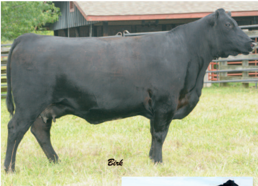
TANNER LADY 2P61 X278 Dam of Lot 28 embryos