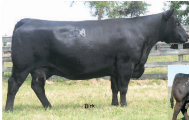
BCC AMBUSH ANITA 41-158 Dam of Lot 30 embryos

The donor dam of this mating is a full sister to B C C Bushwacker 41-93. She has generated $150,000 in progeny sales, including a $20,000 bred heifer at Tanner Farms in MS, an $8,500 daughter that sold to the Decades of Excellence Group, and a $6,000 daughter that sold through a Tennessee River Music Sale. A full sister to 41-158 was the $30,000 top-selling Lot 1 female of the 2006 Byrd Cattle Co. Sale to Stoney Fork Angus of Virginia. The sire of these embryos, Chisum, offers a unique maternal pedigree. He displays and transmits a tremendous amount of body mass for a calving ease sire along with top percentile EPD rankings.