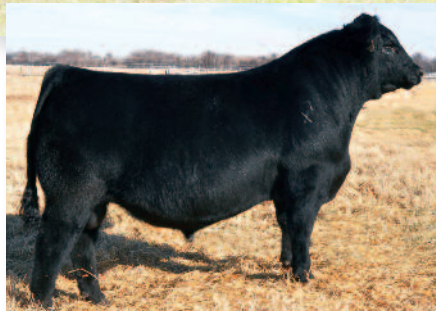
EXAR DENVER 2002B Sire of Lot 28 embryos