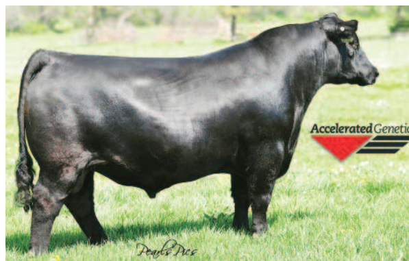
BUFORD OKLAHOMA X239 Sire of Lot 25A embryos