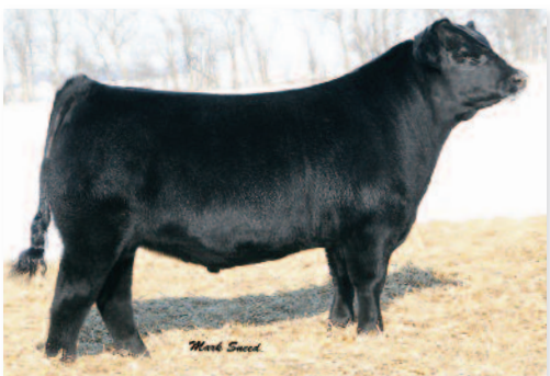
PVF WINDFALL SCC 9005 Sire of Lot 21