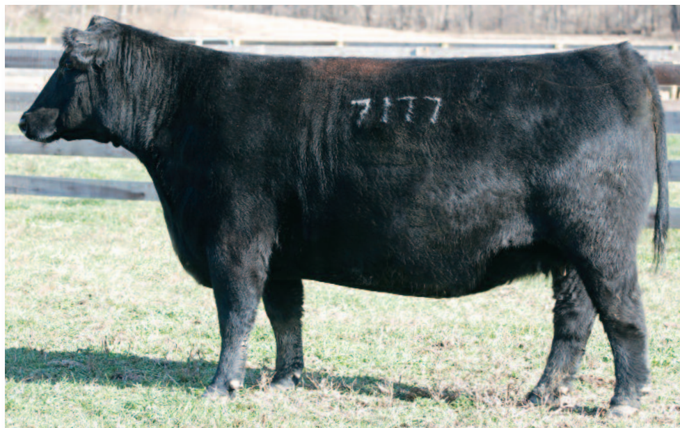
LaGRAND LUCY 7177 Dam of Lots 12A and 12B buyer's choice pregnancies