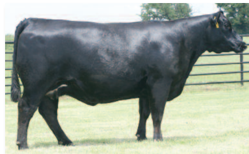
C&H EVER ENTENSE 4038 Maternal grandam of Lot 2