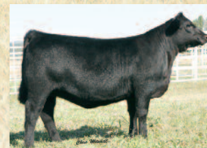
DEER VALLEY HENRIETTA 3168 $135,000 half interest full sister to Lot 1