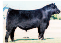
EXAR LUTTON 1831 Sire of Lot 12B pregnancy