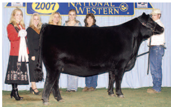
EXAR PRINCESS 5464 Maternal grandam of Lot 22