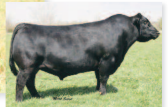
MF NET RETURN 8197 Sire of Lot 31 embryos