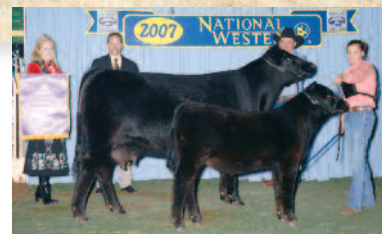
G 13 PROSPERITY 3207 Dam of Lots 13, 13A and 13B