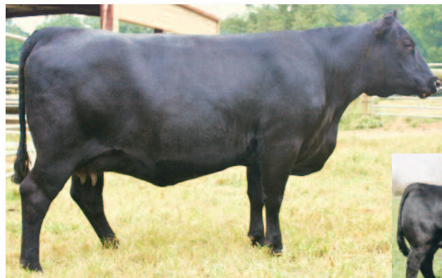
UB EVERELDA ENTENSE 38 Dam of Lot 31 embryos

The donor dam of the Lot 31 embryos has a unique and interesting pedigree that combines both Everelda Entense 1137 and Everelda Entense 1905. Everelda Entense 38 offers impressive phenotype with the depth of body and extra stifle that she transmits to her progeny. Poe Farms, Dallas, GA, purchased half interest in her as a two year old for $7,000. The sire of the embryos, Net Return, is a full brother in blood to the performance and muscle leader Net Worth that offers a more moderate birth weight package than his brother. Net Return is a moderate framed bull who is expressively muscled, as is evident in his 16.4 square inch REA measurement.