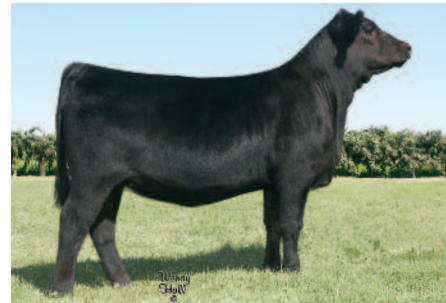
SILVEIRAS SARAS DREAM 3340 $20,000 full sister to Lot 3 pregnancy... purchased by Dylan Denny, Lubbock, TX