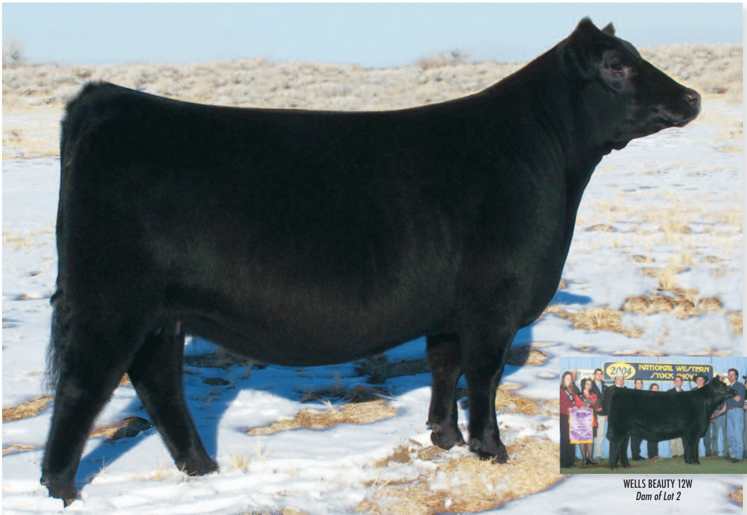
WELLS BEAUTY 12W Dam of Lot 2