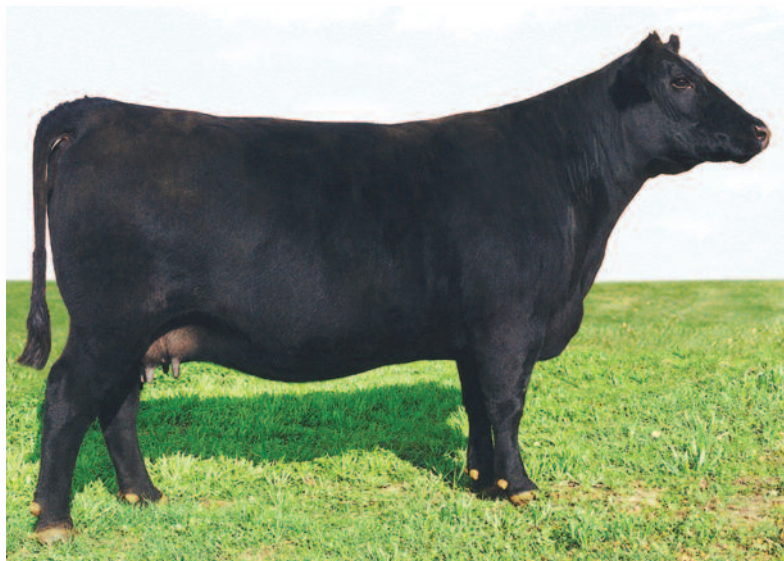
BEAR MTN FOREVER LADY 601 Maternal grandam of Lots 34 and 35 embryos

The sire of embryo Lots 33, 34 and 35, BSF Opportunist Z5, is sure to be among the most talked-about Angus bulls in Denver. His unique and powerful phenotype has made an impression on all who have seen him. His service to some of the top donors from the Patton Family herd are sure to produce incredible results.