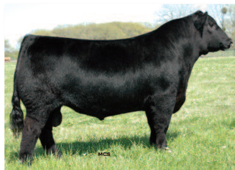
KB MAX OUT 819 Maternal brother to Lot 21 and sire of Lot 22