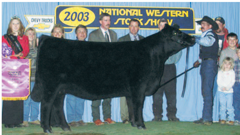
GREENS PRINCESS 1012 Maternal grandam of Lot 23 pregnancy and Lots 23A–23B embryos