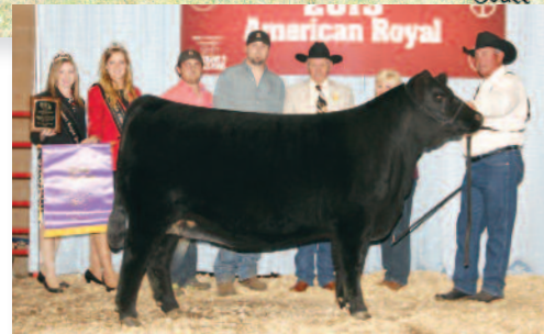
SILVEIRAS SARAS DREAM 2335 $36,000 half interest maternal sister to Lot 3 pregnancy

This mating of the triple-crown winning First Class with S609 is proven and offers limitless earning potential.