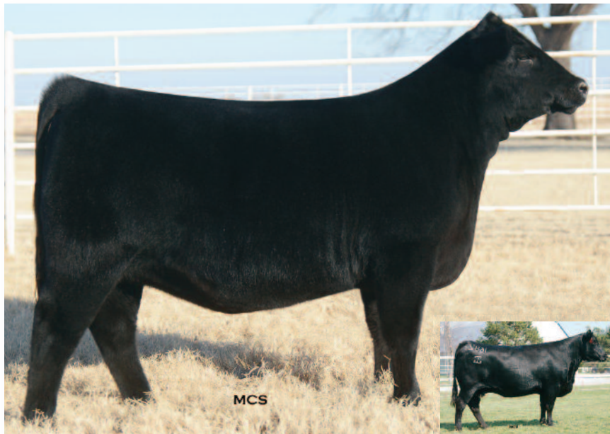
G A R LOAD UP 1682 Maternal grandam of Lot 10

This powerful donor prospect is from the featured Blackcap in the 44 Farms donor program, Blackcap 7977, and is sired by the $120,000 multi-trait 44 Farms sire, Capitalist 028. Blackcap 7977 is a direct daughter of the $80,000 foundation donor in the Express Ranches, Finley Brothers and SandPoint Cattle Company programs, Load Up 1682, and is sired by the long-time Quaker Hill Farm herd sire battery leader S S Objective T510 0T26. All total, 7977 has generated over $88,000 in progeny and embryo sales for 44 Farms, including two maternal sisters to Lot 9 by Consensus that sold to Vintage Angus for $13,500 each in the 2012 44 Farms Female Sale.