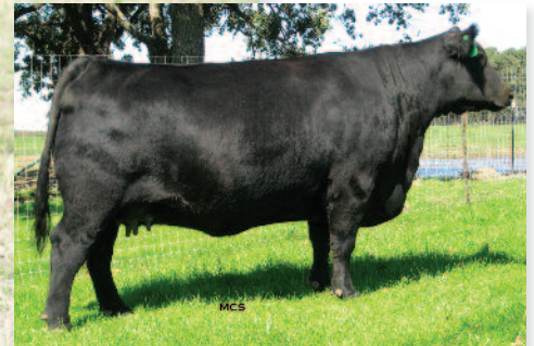
4J LADY VRD MAXINE 3610 Dam of Lot 21