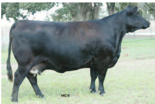
EXAR PRINCESS 5464 Maternal grandam of Lot 22

This June show and donor prospect combines the Princess family with KB Max Out 819, whose flawless phenotype allowed him to be named Reserve Grand Champion Bull at the 2010 Fort Worth Stock Show ROV and the 2010 National Western Intermediate Champion Bull. In addition, Max was named Grand Champion Bull at the 2010 Dixie National and the 2009 Houston Stock Show, Senior Champion at the 2010 Houston Stock Show, Reserve Calf Champion at the 2009 National Western, Division Champion at the 2009 State Fair of Texas and a class winner at the 2009 Fort Worth Stock Show and 2011 National Western. Princess 3353 possesses the same added rib, bone, dimension, neck extension and profile as her dam, grandam and great-grandam and is destined to yield equally impressive results in the show ring.