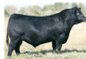
SAV BEST INTEREST 0136 Sire of Lot 13B embryos

His beautiful dam, by Net Worth, is the No. 1 Marbling cow in the SAV herd and has joined the embryo program in the tradition of her Pathfinder® dam, who records a weaning ratio of 108 on seven calves.