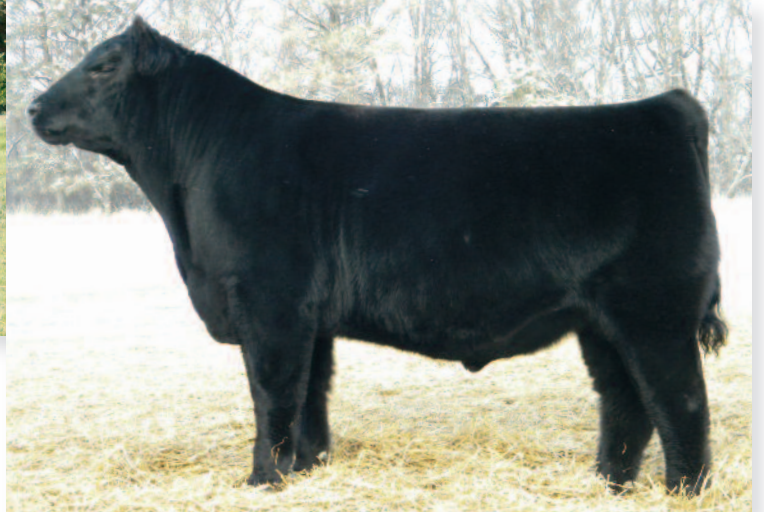
BUSHS UNBELIEVABLE423 Sire of Lot 7 pregnancy