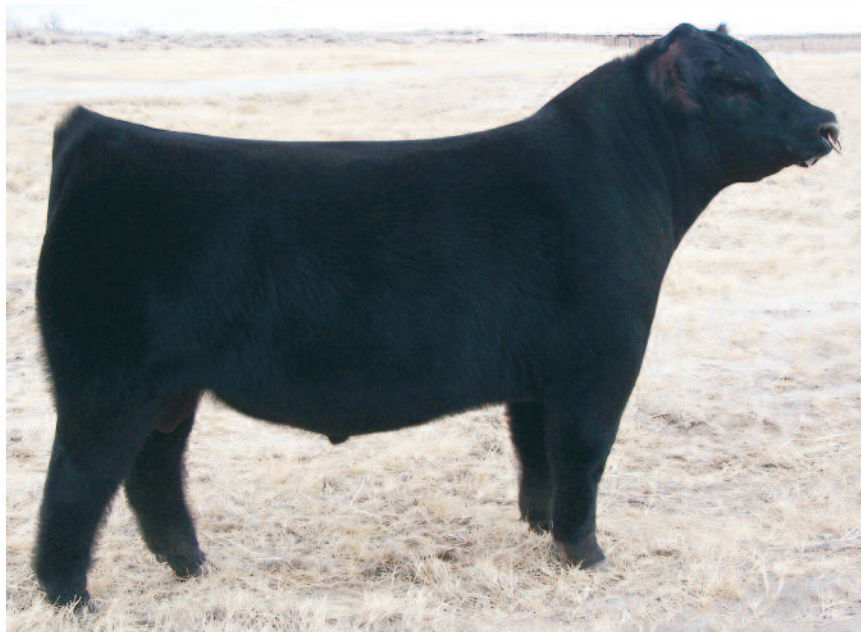
BSF OPPORTUNIST Z5 Sire of Lots 33, 34 and 35 embryos

601 is a maternal sibling to one of the breed's greatest producers, VAR Forever Lady 4304. In addition to 9019 and 657, 601's progeny were highlights of past LaGrand sales and include the $14,500 half interest Forever Lady 2706. Other maternal sisters to the donor dams of Lots 34 and 35 include SK Patton Forever Lady 701, who resides at Lemenager Cattle Company, Hudson, IL, and has generated over $200,000 in progeny sales, and a host of other sisters that have averaged in excess of $20,000.