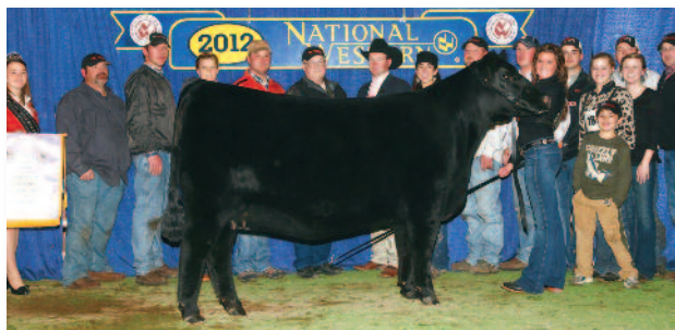
GAMBLES BSJ BEAUTY 1120 Maternal sister to Lot 2