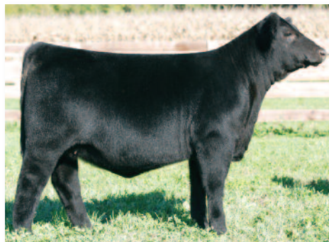
BCII LUCY 7313 $8,500 full sib to the Lot 12B pregnancy and maternal sib to the Lot 12A pregnancy