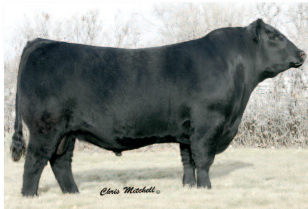
VIN-MAR O'REILLY FACTOR Sire of Lot 24B embryos... also sire of Lot 32B embryos