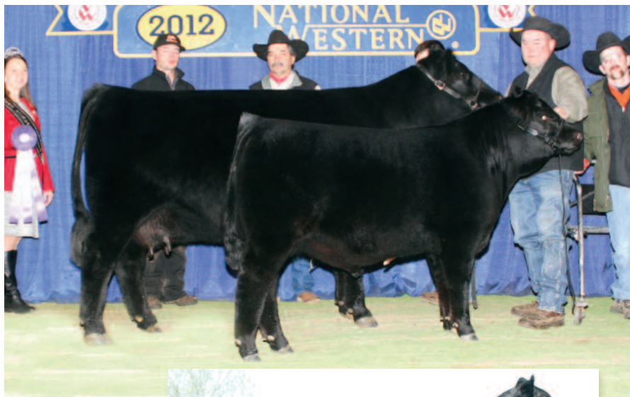
LAF LINS PRIMROSE 8153 Dam of Lots 25A–25B embryos