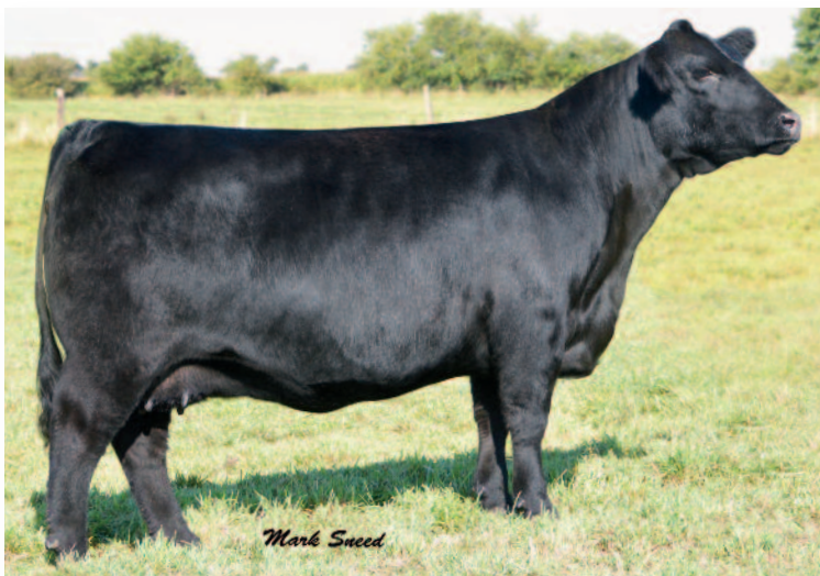
PATTON LADY AGNES 039 Dam of Lot 33 embryos

The dam of the Lot 33 embryos compiled an impressive show record that included Calf Champion of the NAILE junior show and class winner in the open show; Reserve Division 3 at the Hoosier Beef Congress; Grand Champion Female and Supreme at the Indiana Preview; reserve division at the National Junior Angus Show; division winner and Reserve Champion Angus at the Indiana State Fair junior show and division champion in the open show; and a class winner at both the NAILE and NWSS as a bred heifer. Her first calf was a second prize winner at Louisville and a division winner as a bred at the Indiana Preview Show. She is owned with Topline Angus, Tremont, IL.