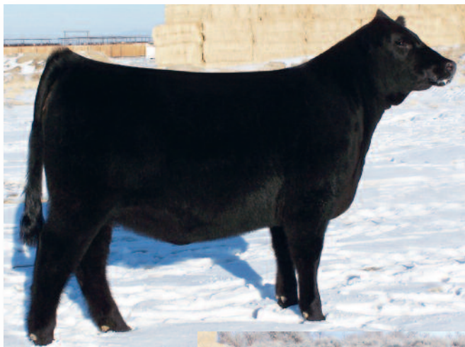
BAAR USA WENDY 359 Lot 16A

On the dam side, the Wendy cow family has been among the most prolific in the Broken Arrow USA herd, and Wendy 040, the famous grandam of these show and donor prospects, has helped build that legacy with the job she has done in both the Broken Arrow USA and Express Ranches programs. She was a member of the famous flush that mated Russ with Wendy 618. The dam of Lots 16A and 16B was a donor in the LaGrand program before rejoining her birth herd after Troy re-acquired her through the LaGrand dispersion. Wendy 3125, a full sister to Wendy 5133, produced over $100,000 in embryo progeny in 2010 alone for Silveira Brothers and Express Ranches, including Silveiras Wendy 0301, a daughter that sold in the 2010 Silveira Sale that was Reserve Early Spring Calf Champion at the 2011 WNAF Junior Show for Austin Traynham, Maxwell, CA.