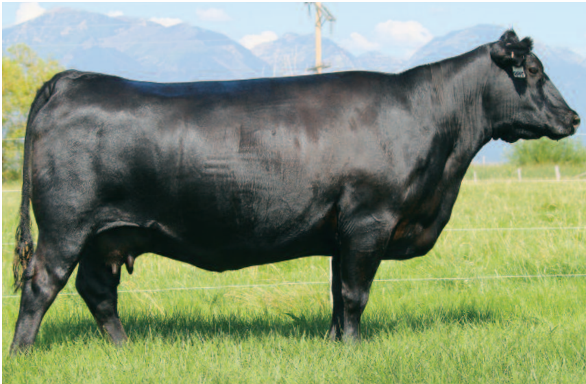
O C C DIXIE ERICA 744P Dam of Lot 27 embryos

This mating combines two of the most prolific families in the Ohlde program, Dixie Erica and Blackbird, on both sides of the pedigree, line bred to such breed greats as F0203, 6807, EXT and Dixie Erica of C H 1019. The sire, OCC Paxton 730P, is known for transmitting muscle and rib to his progeny while maintaining the udder quality, maternal strength and grass efficiency that the Ohlde genetics are famous for. The donor dam of this mating is a maternal sister to the extremely popular and proven A.I. sire OCC Juneau in this female who is double-bred to the great Dixie Erica family. 744P is now a donor for Coleman Angus in Charlo, MT, after they selected her as the top selling female of the 2012 Tennessee River Music Sale. 744P ranks in the top 1% of the breed for RE and transmits that muscle to her progeny. She currently holds a progeny production record of WR 1@104. Her dam excels with progeny ratios of WR 7@105, YR 6@105 and UREA 44@111. In addition, there are a total of 12 daughters produced from her dam with an average nursing ratio of 101 on 30 progeny.