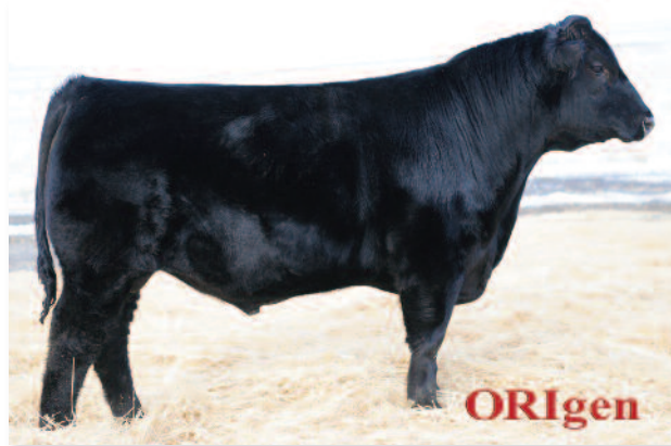
SYDGEN TRUSTWORTHY 2012 $20,000 maternal sib to Lot 26 embryos

Her grandam, Forever Lady 4123, is a long-time favorite cow, and her dam is one of the original females from GDAR and the great-great-grandam of SydGen C C & 7.