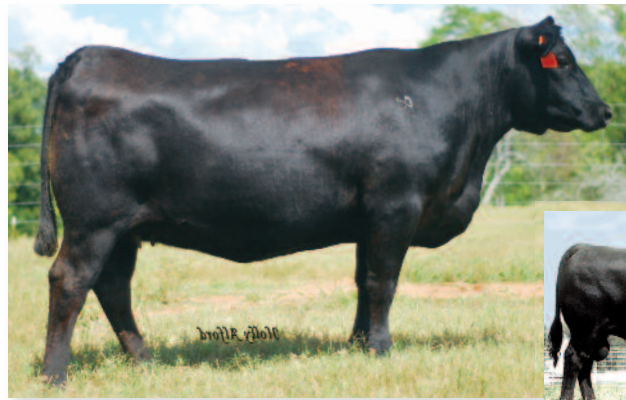
AKERS BLACKBIRD 9597 Dam of Lot 29 embryos