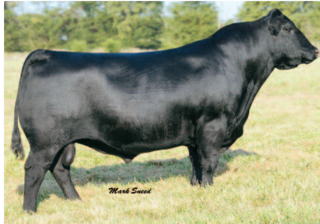
CONNELLY FINAL PRODUCT Sire of Lot 24A embryos