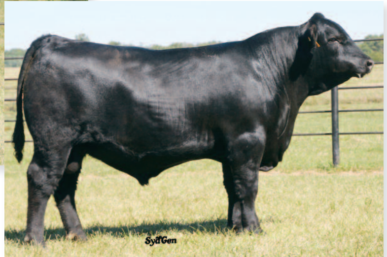
SYDGEN FATE 2800 $113,000 2/3 interest sire of Lot 26 embryos