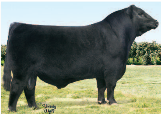
SILVEIRAS STYLE 9303 Full brother to dam of Lots 6 and 7

This mating is definitely "bred in the purple."