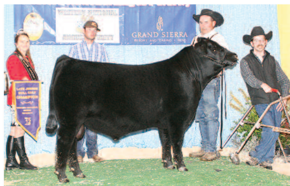
LAF LINS STORM 1102 Maternal sib to Lots 25A–25B embryos

The dam of the embryo matings selling as Lots 25A and 25B, Laffins Primrose 8153, was named the Grand Champion Cow/Calf Pair at the 2012 National Western Stock Show and is a foundation female for North Camp. This moderate framed, powerfully constructed donor female possesses flawless udder structure and produces a standout calf every year. Her progeny include Laffins Alternative Power 2100, who was the fourth high selling bull at the Midland Bull Test in 2013 to New Haven Angus Ranch, Leavenworth, KS, for $17,500, and Laffins Storm 1102, who was the calf at side when 8153 was named Grand Champion Cow/Calf Pair at the 2012 National Western Stock Show. Storm was purchased by Silveira Brothers of California for $10,000 after being named the Late Junior Bull Calf Champion at the 2012 Western National Angus Futurity in Reno.