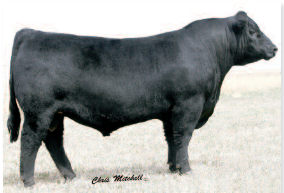
CONNELY CONFIDENCE 0100 Sire of Lot 23B embryos