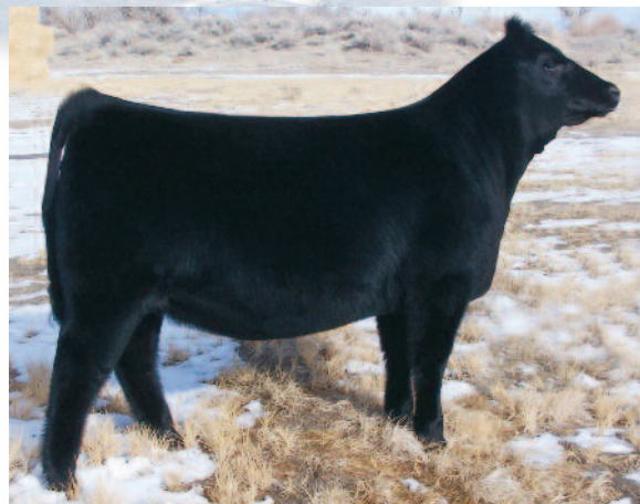
BAAR USA WENDY 321 Lot 16B