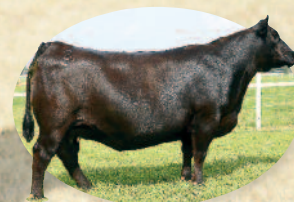
SITZ HENRIETTA PRIDE 643T Donor dam of Lot 1