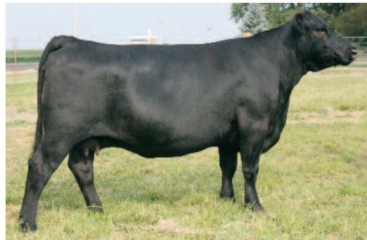
FANCY CHANCE POLLY 215 Dam of Lot 4