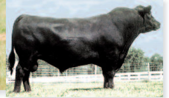
LEACHMAN RIGHT TIME Sire of Lot 29 embryos