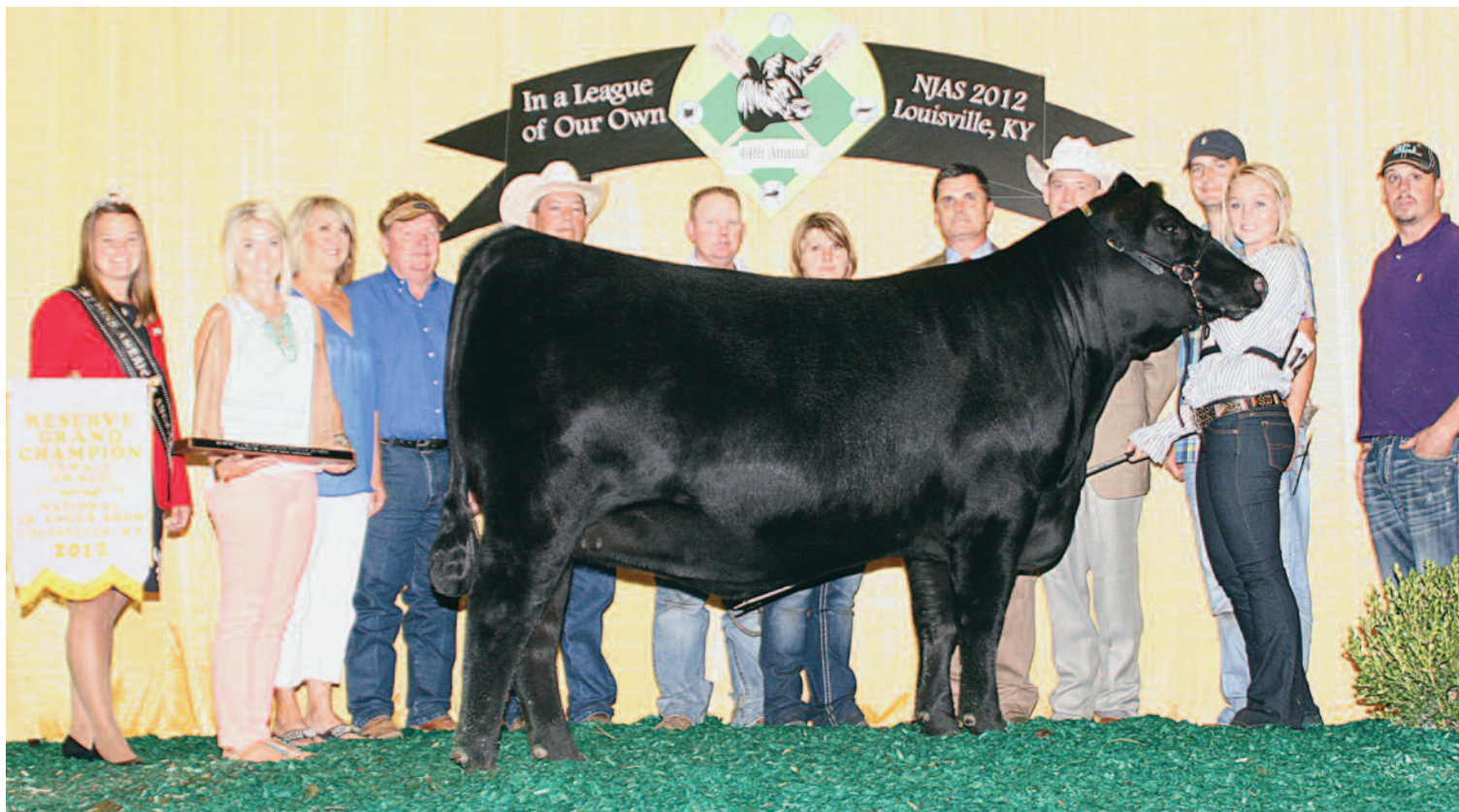
EXAR FOREVER LADY 1414 Full sib in blood to the Lot 20 buyer's choice ET heifer calves