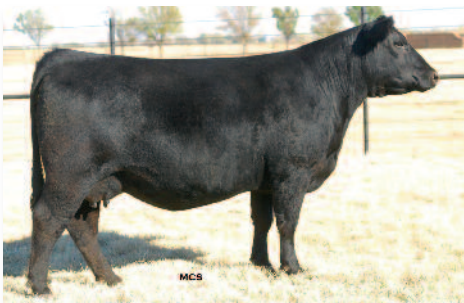
PF EVER ENTENSE 0273 Dam of Lot 5

Lot 5 is one of the most powerful females in this year's offering in terms of muscle mass, rib and volume. Her EPDs are genomically enhanced and rank in the top 1% of non-parent Angus females for $W and $B, the top 2% for WW and SG, the top 3% for RE, the top 4% for YW, the top 5% for SQG and SYG and the top 10% for Milk, Marb and $E. With her physical attributes, EPD profile, 114 weaning weight ratio and impressive PF50 results, Ever Entense 3114 is one of the most unique daughters of Consensus offered to date and is destined to make her mark on the breed!