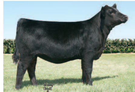
SILVEIRAS SARAS DREAM 3329 $34,000 full sister to Lot 3 pregnancy... purchased by Garrett Coffland, IA