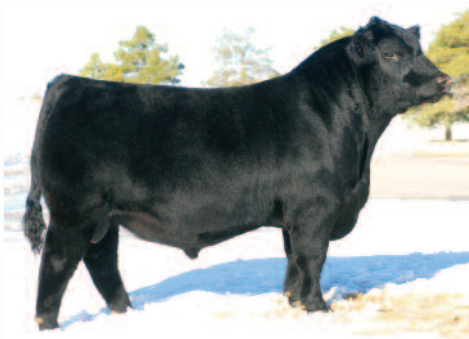
DAMERON FIRST CLASS Sire of the Lot 20 buyer's choice ET heifer calves

TERMS: Selling buyer's choice of seven heifer calves due 2.7.14. Selection may be made as soon as the buyer wishes but must be made no later than 8.1.14. Thompson Livestock will house the heifers at the side of their recipient dams in Stillwater, OK, until the selection is made. Payment is due at the time of sale.