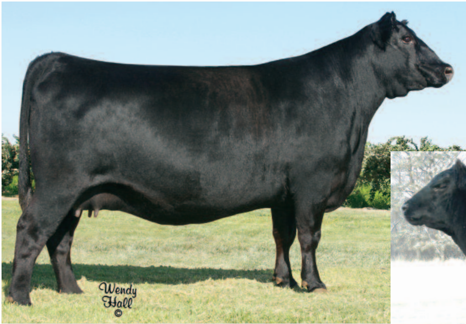
SILVEIRAS ELBA 6540 Dam of Lot 7 pregnancy