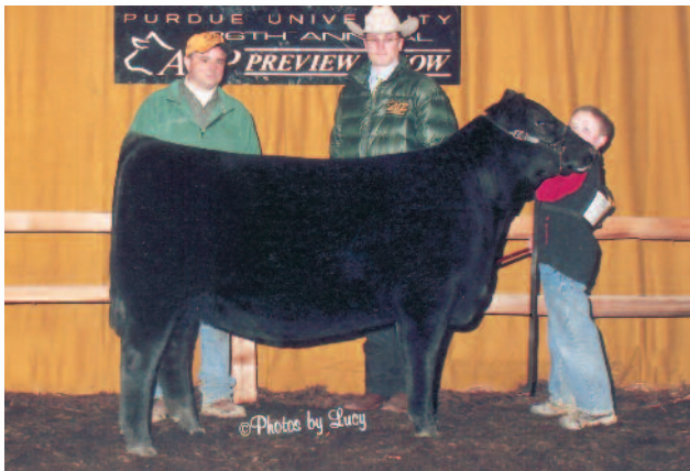
BLACK ACE ZOE 706 Dam of Lots 32A–32B embryos

The dam of the Lot 32A and 32B embryos had a great show career that included being named Champion Female at the Indiana Open Preview Show as well as being a division winner at the Indiana State Fair Open and Junior shows and a class winner at the National Western Livestock Show, both junior and open shows. Since her successful show career has ended, Zoe has produced some really good ones! Her first heifer calf sold for $6,000.