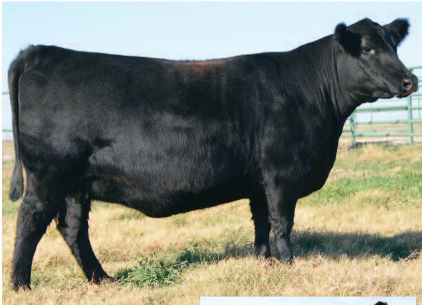
TEXAS LUCY 110 Dam of Lot 36 embryos