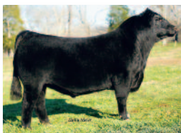
GAMBLES SAFE BET Sire of Lot 13A embryos

Gambles Safe Bet was the $37,500 featured Lot 1 herd sire prospect in the Spring 2011 Sure Bet Annual Spring Production Sale. He went on to enjoy a successful show career that included being selected the Grand Champion Bull at the 2011 Dixie National ROV Angus Show, Junior Champion at the 2011 All-American Breeders' Futurity, Grand Champion Bull at the 2011 Southern National, Late Spring Bull Calf Champion at the 2011 Atlantic National ROV Angus Show, 2011 Kentucky State Fair Grand Champion Bull, 2011 West Virginia State Fair ROV Grand Champion Bull and the 2011 Tennessee State Fair Grand Champion Bull.