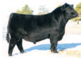
DAMERON FIRST CLASS Sire of Lot 12A pregnancy