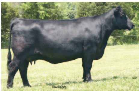
WELLS BEAUTY 12W Dam of Lot 2

Beauty Y227 blends power and angularity to yield the look and presence needed to transmit tremendous show ring potential to her offspring. If you are in need of a true show heifer producer, here is one that you can't miss.