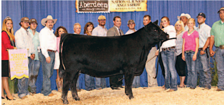
SILVEIRAS ELBA 2342 Maternal sister to Lot 7 pregnancy... 2013 NJAS Division Champion

The $62,500 sire of this mating, Unbelievable, is an incredibly designed calving ease sire that owns unique neck extension, unquestioned structural soundness, extra special belly depth and super muscle shape.