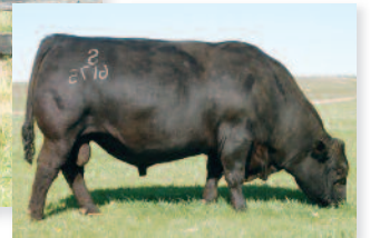
S CHISUM 6175 Sire of Lot 30 embryos