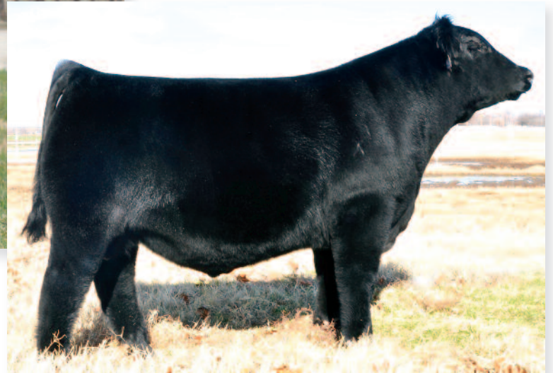
EXAR CLASSEN 1422B Sire of Lot 6 pregnancy