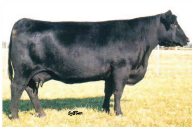
SYDGEN FOREVER LADY 4123 Great-grandam of Lot 26 embryos