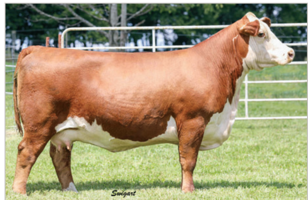
ASM 705 10Y MISS MALLORY 405B Dam of Red Man