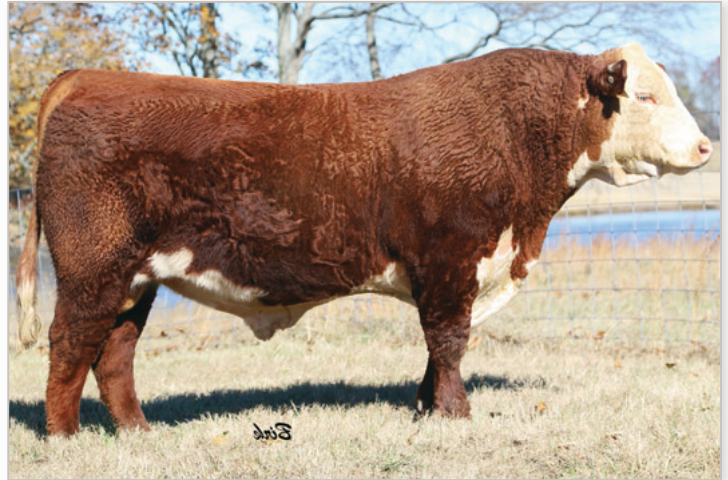
JW 1857 MERIT 21134

Sire of several of the spring calves selling. His AI service also sells.