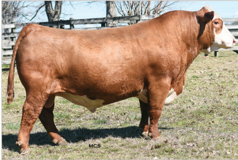
/S PERFECTO 00572 ET Sire of the spring calves selling as Lots 37A, 40A, 42A, 47A & 51A