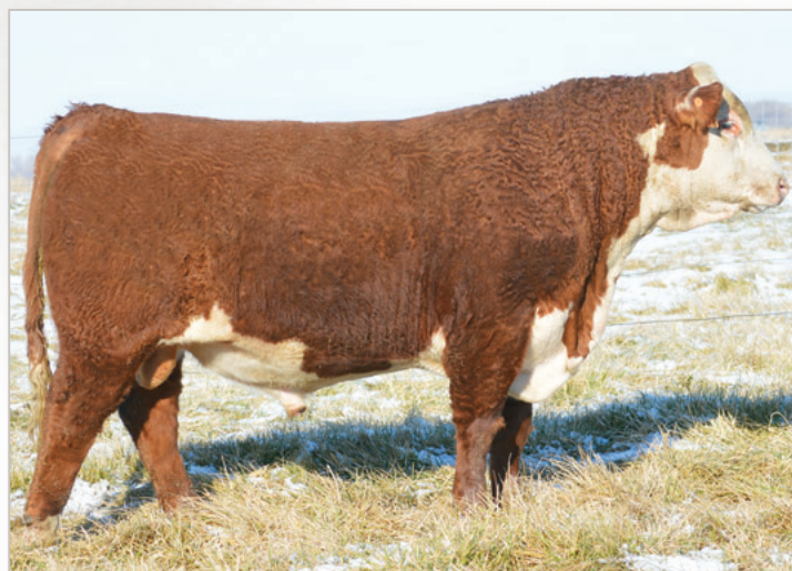
/S TESTED 55576 Sire of Lot 56