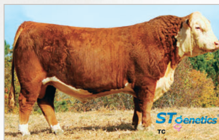
INNISFAIL WHR X651/723 4013 ET Sire of Lot 39