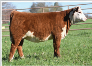
$6,000 Merit heifer calf