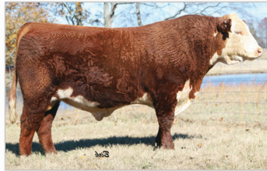
JW 1857 MERIT 21134

B bull /S PERFECTO 00572 ET (DLF,HYF,IEF,MSUDF) DOB 8/31/20 | AHA P44234898 | TATTOO 00572 | POLLED