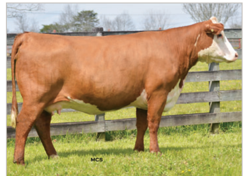
SFCC TRM LADY HERITAGE 9124 $15,000 maternal sister to Lots 2-6 & to the dam of the Lot 7 embryos