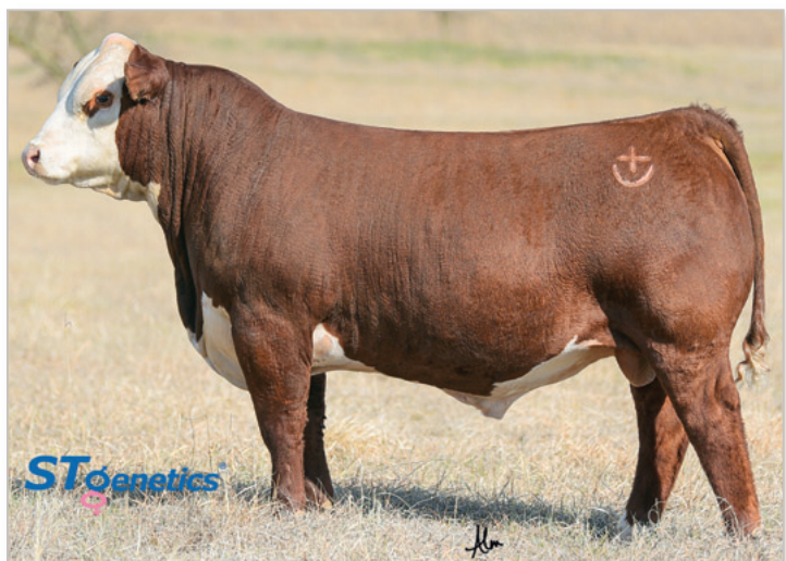
SHF HOUSTON D287 H086

Homozygous polled sire of Lot 58 embryos.