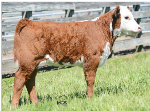
SFCC LADY FORTIFIED 1041 ET $24,000 maternal sister to Lots 2-6 & to the dam of the Lot 7 embryos

Lots 2-7 descend from one of our top Hereford donors, /S Lady Peerless 4007B