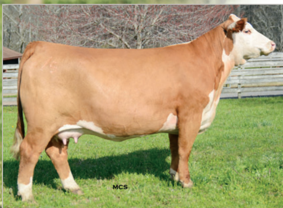
/S LADY THOR 2447Z $43,000 dam of Lot 1