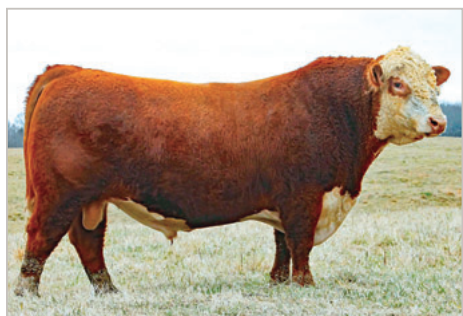
JW 716 DEVOUT 18051 Sire of Lots 18 & 19