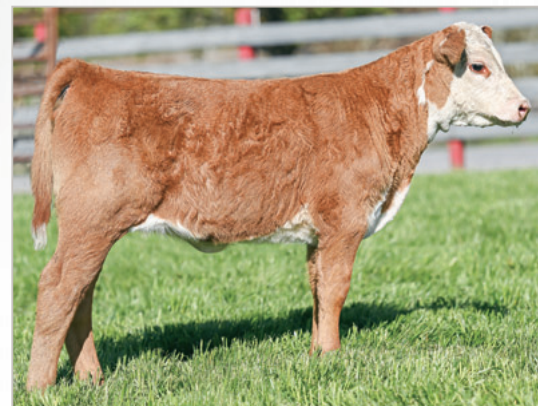
SFGC TRM LADY MERIT 3140 $11,000 daughter of the Lot 8 donor & maternal sister to Lots 9 & 10