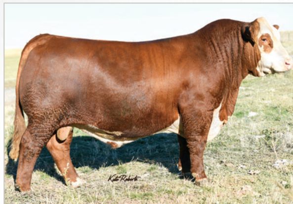
EXR GENERATOR 0333 ET Sire of Lot 65 embryos