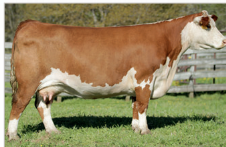
RRO TRM LADY 1135 ET Maternal granddam of Lot 63