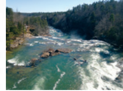
Little River Canyon National Preserve Park

If we can help you in any way, please don't hesitate to contact us.