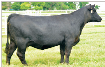
EXAR EMPRESS 1867 Dam of Lot 101