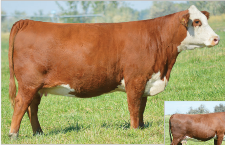
/S LADY DOMINO 652S