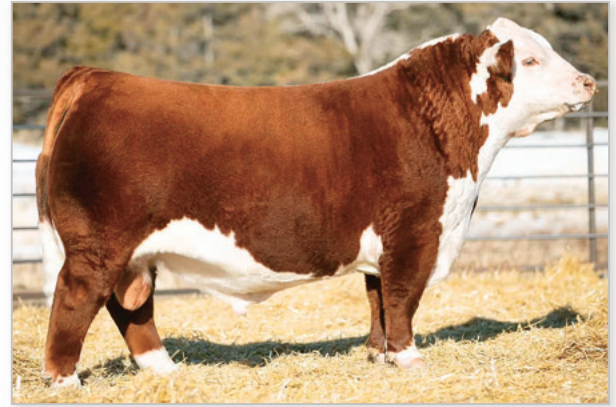
H WMS THOMAS COUNTY 1443 ET Sire of Lot 7 embryos