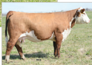
/S LADY ON TARGET 5291C ET Granddam of Lot 64 embryos