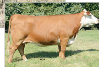
GO MS 7195 ADVANCE W49 Third dam of Lot 65 embryos