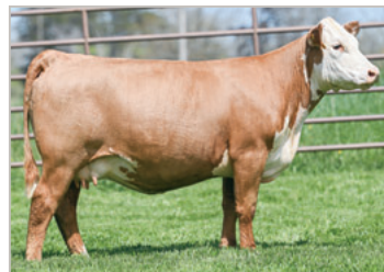
/S LADY ADVANCE 1016J ET

$100,000-valued full sister to Lot 11 & maternal sister to Lot 12 ...flush sells as Lot 8