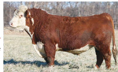
H B DISTINCT Sire of Lot 9 & Lot 10 embryos

Lots 8–16 descend from the highly successful 0158X / 652S cow family.