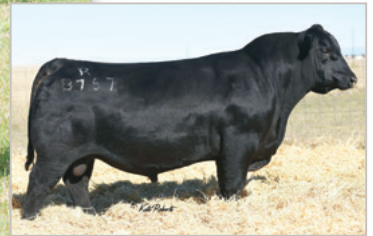
TEHAMA TAHOE B767 Sire of Lot 107