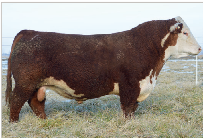
/S JBB/AL BOOM TOWN 44608 Sire of Lots 29 & 30

If you can't join us in person sale day, watch the sale and bid in real time online!