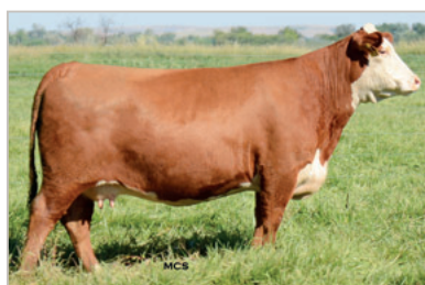
/S LADY DOMINO 9144W Maternal granddam of Lot 27