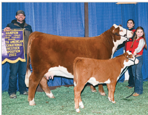
Lot 1 at the 2022 NAILE