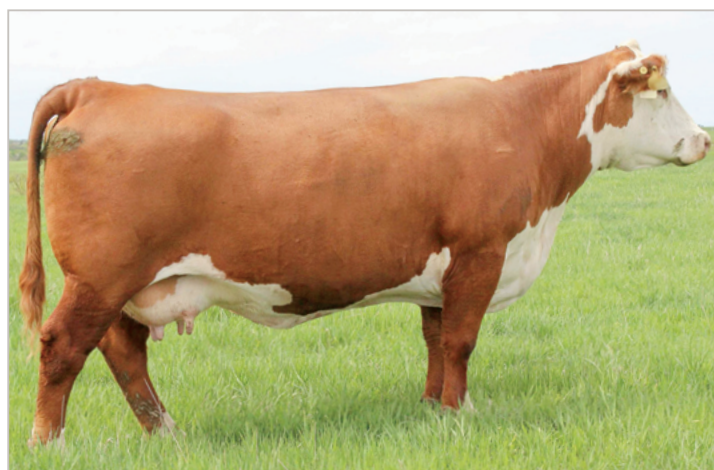
ANL P606 MARIE ET 907 Maternal granddam of Lot 50