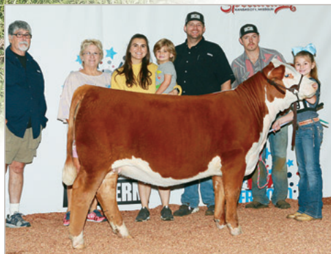
Lot 1 at the 2021 JNHE