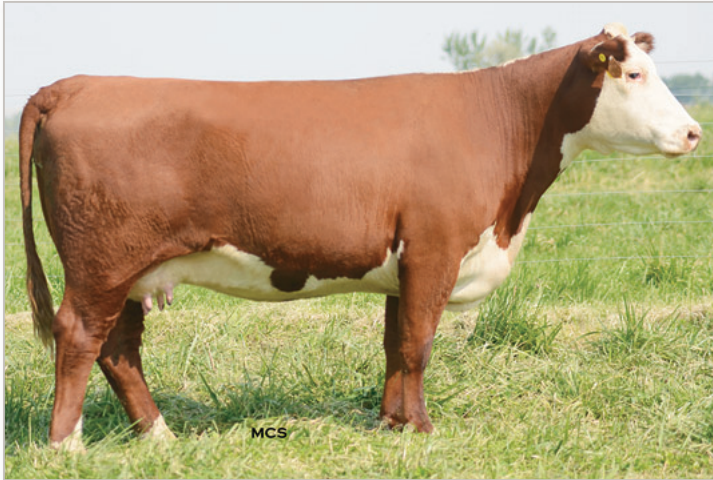
/S LADY DOMINO 827F Dam of Lot 23