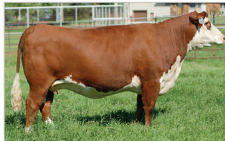
LOEWEN MISS ON TARGET 10Y 1A Dam of Lot 42

42 /S LADY 628 ADVANCE 0012H ET (DLF,HYF,IEF,MSUDF,DBP) DOB 1/16/20 | AHA 44170984 | TATTOO 0012 | HORNED