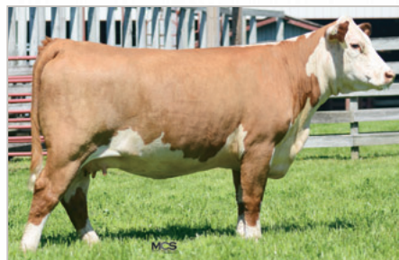
SFCC TRM KIRRA 8157 ET Maternal sister to Lot 63