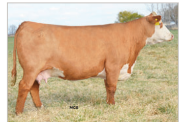
/S LADY DOMINO 0158X

$21,000 full sister to Lot 12 & maternal sister to Lot 11