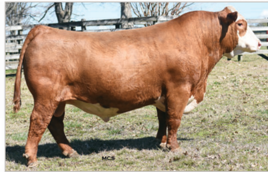
/S PERFECTO 00572 ET

C bull /S TRM MANDATORY 88573 ET (DLF,HYF,IEF,MSUDF) DOB 8/25/18 | AHA 44017618 | TATTOO 88573 | HORNED