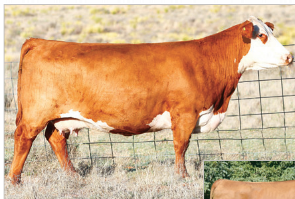
SR W49 CHRISTA 5036 ET Granddam of Lot 65 embryos