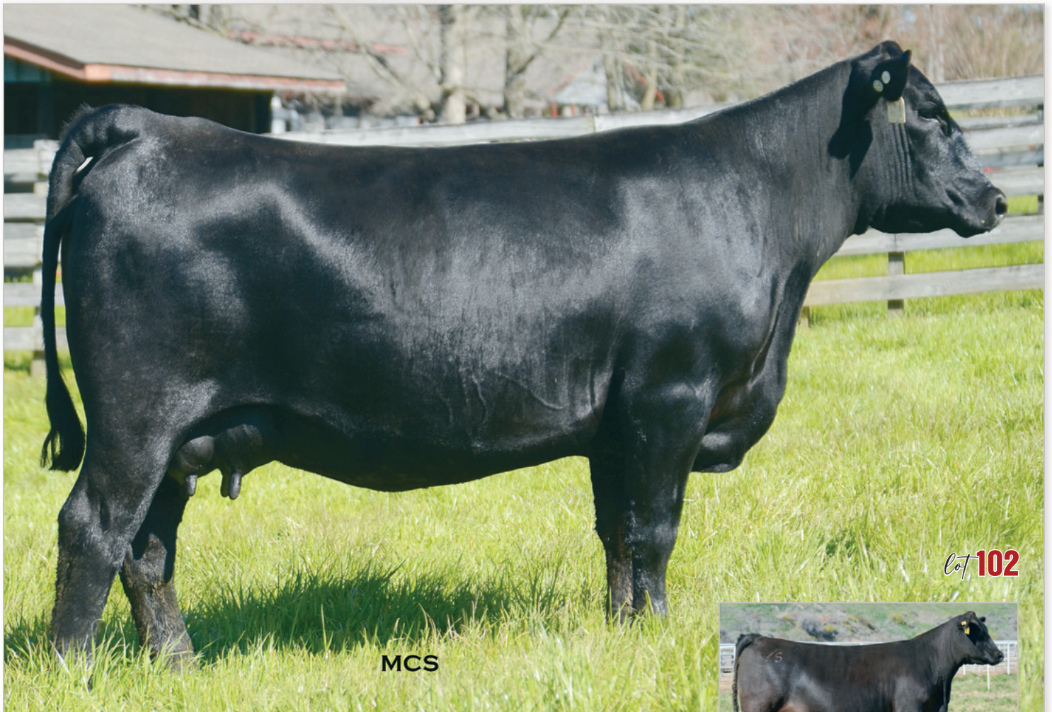
Pictured as a two-year-old