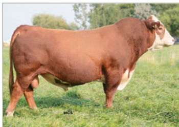
/S MANDATE 66589 ET

Full sib to the dam of Lots 11 & 12 ...16 Mandate daughters sell