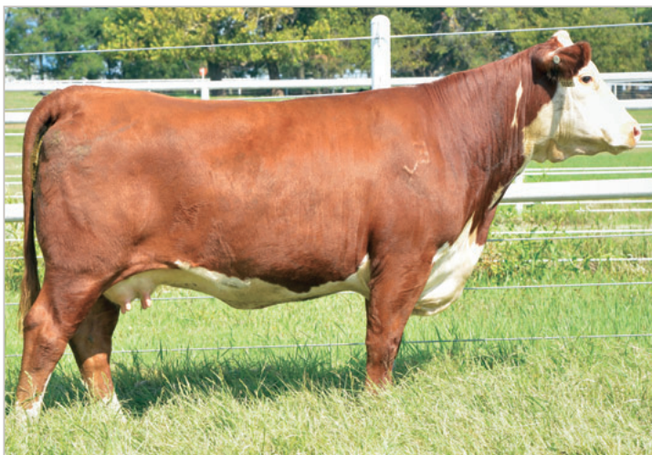
EXR DANI 7200 ET Dam of Lot 61