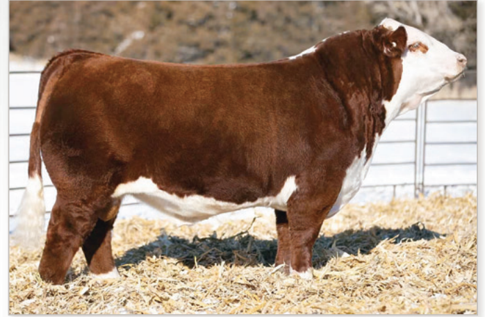
UPS ENTICE 9365 ET Sire of Lots 5 & 6