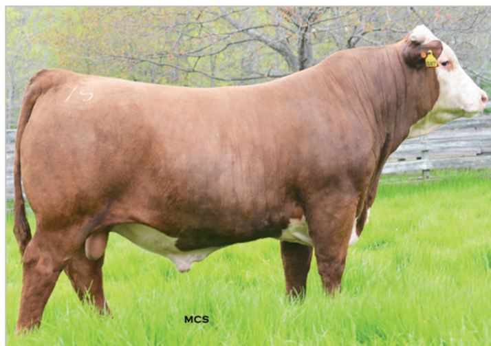
/S TRM MANDATORY 88573 ET Sire of the spring calves selling as Lots 48A, 52A, 55A & 56A & the Lot 57A fall calf

The spring cows will receive one AI service before the sale to Merit or Red Man, so there is a strong possibility of buying three-in-one pairs. Breeding information will be available on the sale supplement and online at mcsauction.com. The spring calves selling at side are registered, and their current EPDs are included in the catalog. DNA will be submitted on the calves prior to the sale.