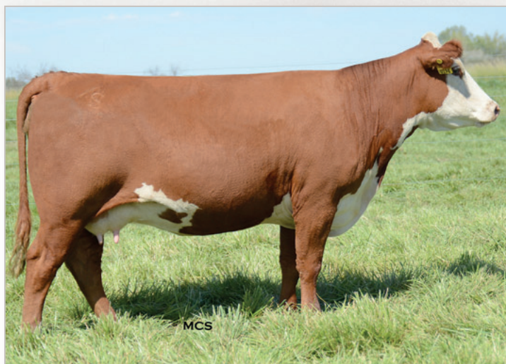
/S LADY ADVANCE 0194X Dam of Lot 55