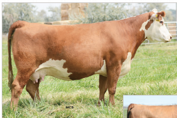
/S LADY BOOMTOWN 890F ET Dam of Lot 64 embryos