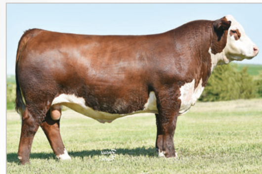
NJW 79Z 2311 ENDURE 173D ET Sire of Lots 27 & 28