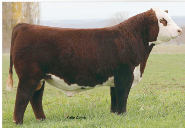
C GKB GUARDIAN 1015 ET Sire of Lot 64 embryos