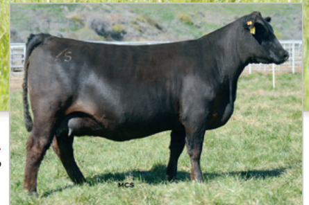
SHAW LADY FINAL PRODUCT 4164 Dam of Lot 102