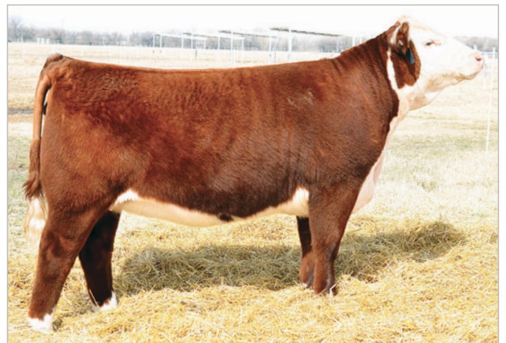
TH 40U 719T DANI 60Z Maternal granddam of Lot 61