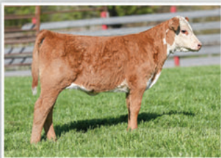
$11,000 Merit heifer calf