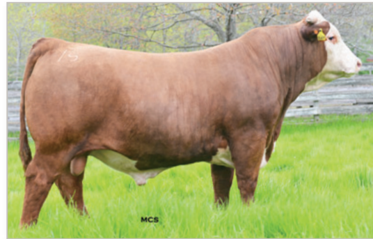
/S TRM MANDATORY 88573 ET

D bull NJW 84B 4040 FORTIFIED 238F (DLF,HYF,IEF,MSUDF,MDF,DBF) DOB 3/5/18 | AHA P43943448 | TATTOO 238F | HOM. POLLED