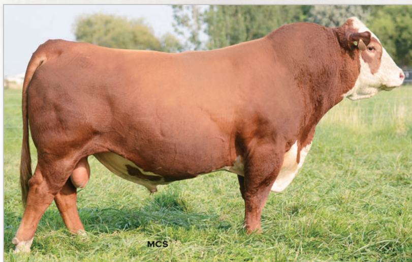
/S MANDATE 66589 ET Sire of Lots 31-38