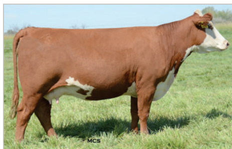
/S LADY ADVANCE 0194X Maternal granddam of Lot 17