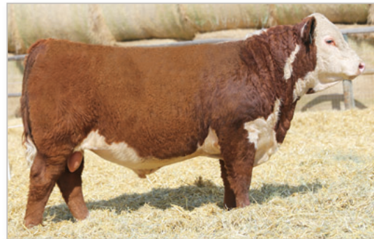
NJW 84B 4040 FORTIFIED 238F

E bull JW 8716 DEVOUT 20183 (CHB) (DLF,HYF,IEF,MSUDF,MDF,DBC) DOB 10/22/19 | AHA P44102047 | TATTOO 20183 | POLLED