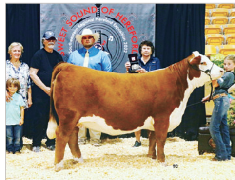
Lot 1 at the 2022 Southeast Regional Hereford Show