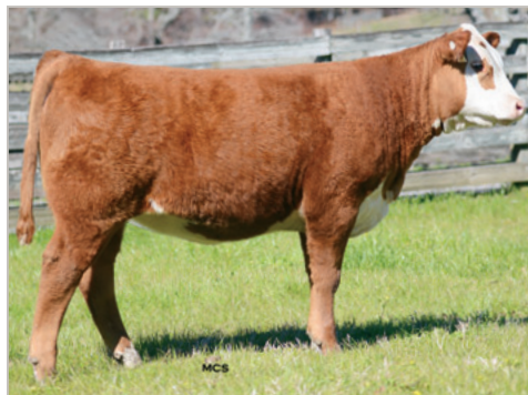
SFCC TRM LADY ENDURE 1138 ET $15,000 maternal sister to Lots 2-6 & to the dam of the Lot 7 embryos