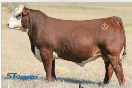
SHF HOUSTON D287 H086