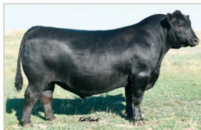
EXAR COVER THE BASES 0819B Sire of Lot 101