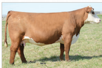
/S LADY ON TARGET 5002C ET Dam of Lot 27