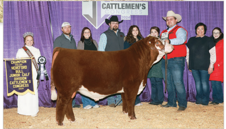
ASM 405B RED MAN 325L ET 2024 Cattleman's Congress Junior Calf Champion Polled Hereford Bull