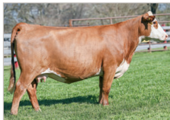
/S LADY ENDURE 0043H ET

Full sib to the dam of Lots 11 & 12 ...16 Mandate daughters sell