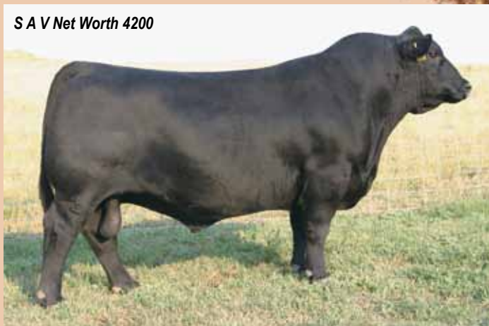
S A V Net Worth 4200

Ranks in the top 1% for RE, top 10% for $F, and top 15% for YW