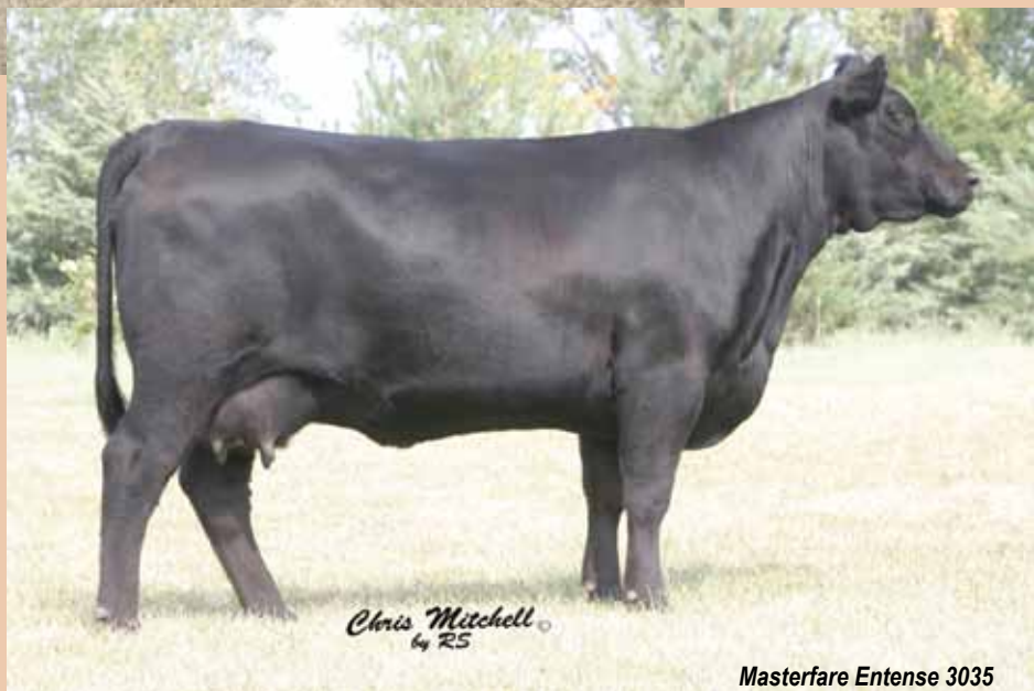
Masterfare Entense 3035

Masterfare Entense 3035 is a favorite here at R&L. She is one of the most prolific females in production at R&L with impressive progeny ratios of BR 1@96, WR 1@116, YR 1@113, %IMF 68@97 and RE 68@100. Her proven genetic traits and consistent phenotypic make up proves her offspring to be among favorites each year and her influence is prominent in this year's offering with twelve sons (lots 8-16 and 72-74) and five grandsons (lots 6-7,51-52, and 61) in the sale.