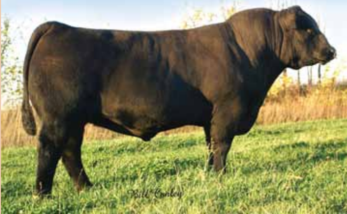
B C Marathon 7022