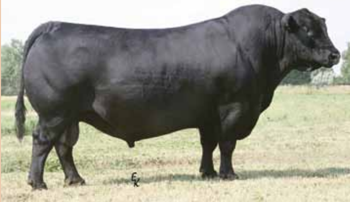
S A V Final Answer 0035

Ranks in the top 15% for CED, BW YW and $W, and top 20% for $F.