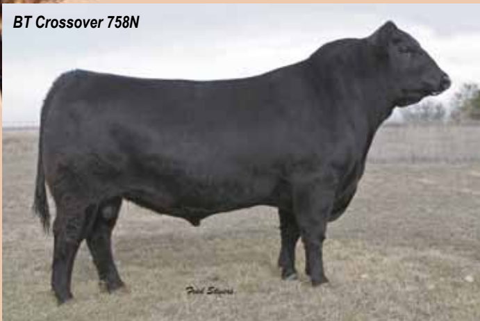
BT Crossover 758N