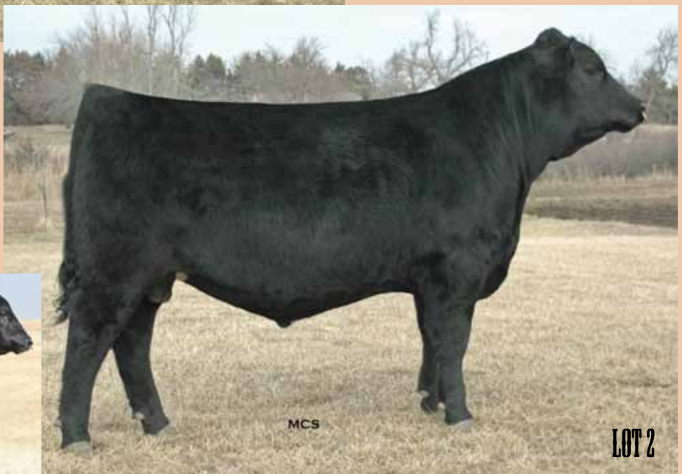
BC Big Daddy 702-5