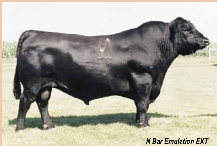
N Bar Emulation EXT