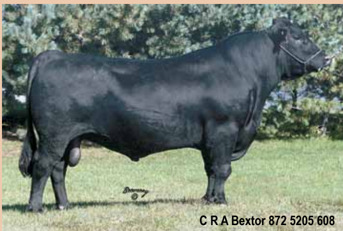
C R A Bextor 872 5205 608

Ranks in the top 4% for YW and $F, and top 10% for WW.