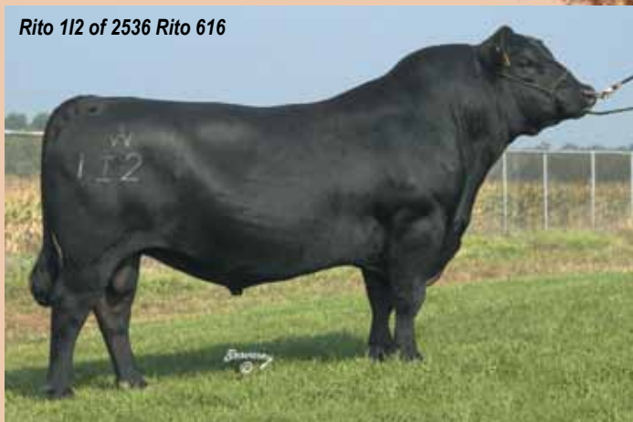
Rito 112 of 2536 Rito 616